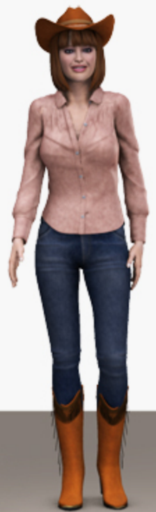
Step back on your right foot