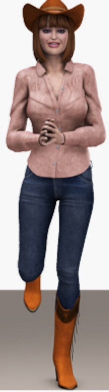
Step forward onto your right foot